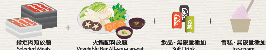
指定肉類放題 Selected Meats