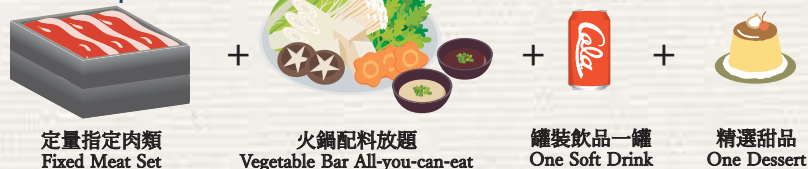
定量指定肉類 Fixed Meat Set